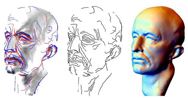
Figure 4: Left: salient ridges and valleys detected on the Max-Planck bust model, T=2. Middle: the ridges and valleys alone are sufficient for recognizing the model. Right: only the ridge and valley vertices and mesh normals at them are used for shape reconstruction via implicit surface fitting.

On the other hand, discriminating between curvature maxima and minima via the second derivative test \nabla e \cdot \mathbf{t} \leq 0 , where \mathbf{t} is one of the principal directions and e is defined by (2), is not practical for processing models with complex geometry.