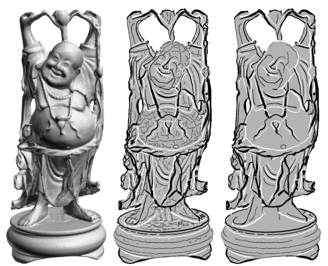
Figure 3: Filtering ridges (black) and valleys (white) according to their strength controlled by parameter T. Middle: T=0. Right: T=2.

Our method combines finite difference schemes and analytical surface fitting techniques used for curvature extrema detection. According to our experiments, detecting the ridge-valley lines from the principal curvature tensor via non-maximum suppression and hysteresis thresholding, as suggested in [Hubeli and Gross 2001; DeCarlo et al. 2003], often produces hairy patterns of poorly connected ridges and valleys. This is especially true for dense irregular meshes approximating surfaces with smooth curvature variations.