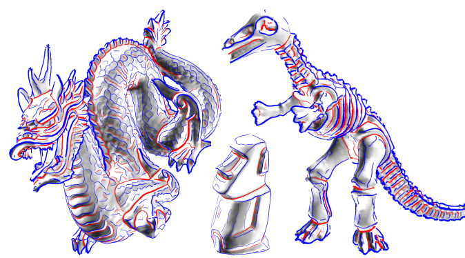
Figure 2: Ridges (blue) and valleys (red) detected on various models, T = 0.5.

Figure 2 shows patterns of ridges and valleys detected on various triangle meshes. Notice how well the ridge-valley lines capture both salient shape features and small shape variations.